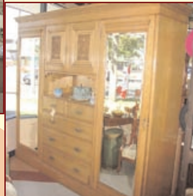
Edwardian Armoire $2500