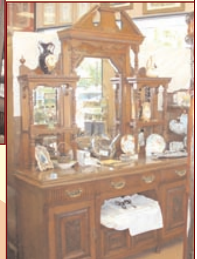
Victorian Sideboard $2500