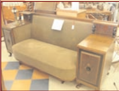
English Chesterfield $1500