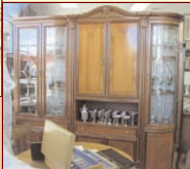
Italian China Cabinet $2000

You want it big? We've got it! You want it bold and beautiful, too? We've got that!