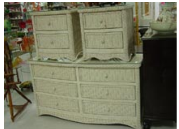
Designer Wicker Bedroom Furniture