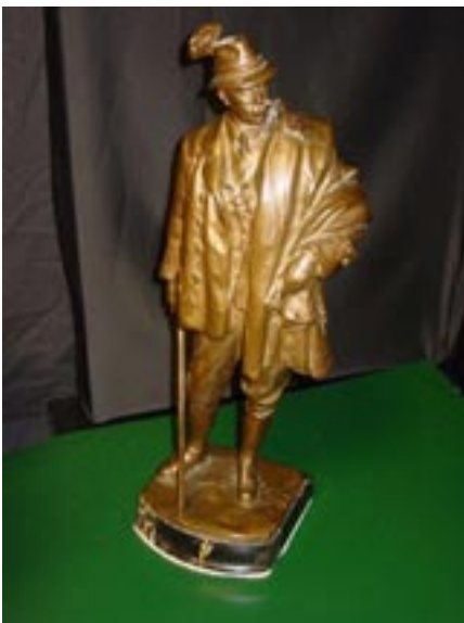
19th Century Original Bronze "The Hunter"

We are completely moved into our new space at the old Fabricland store and have expanded our already diverse inventory to include some very unique and exceptional items, including some very rare early Canadian bottles.