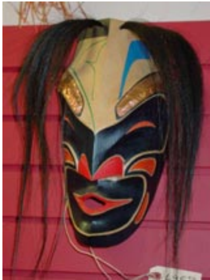
"Spirit Woman" Mask Carved by Cecil Billy

FinePoint Antiques now hosts an outstanding gallery of British Columbia First Nations art and carvings. Check it out for yourself; we now proudly display a large number of outstanding masks, talking sticks and other First Nations cultural artifacts.