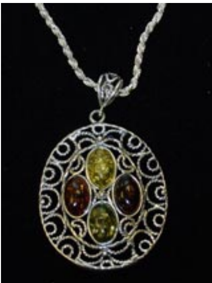
Hand Crafted Designer Jenstone Necklace

You must visit and check out our spacious new look along with the expanded inventory. There is definitely something for everyone at FinePoint Antiques, including Dad.