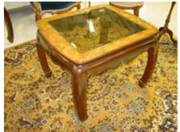
Contemporary Designer Oriental Coffee Table