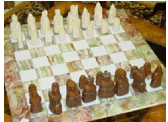
The Lewis Limited Addition Chess Set